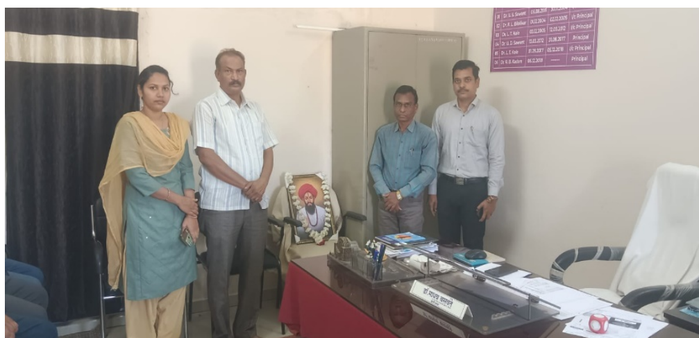
(Celebrating the Bieth Anniversary of Sant Sevalal Maharaj In the College.)