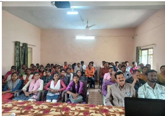
See Audience Students